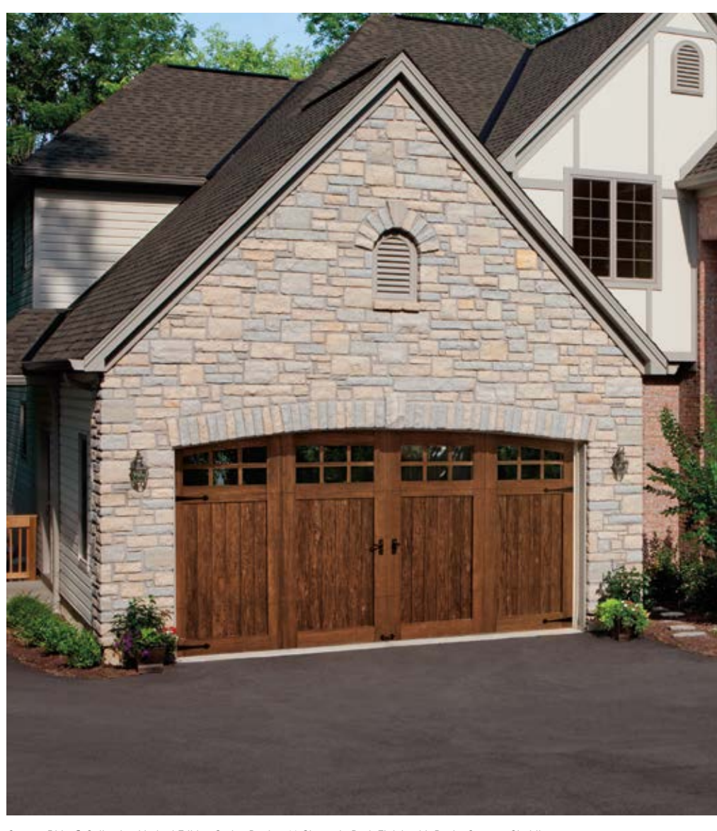
Canyon Ridge® Collection Limited Edition Series Design 11 Shown in Dark Finish with Pecky Cypress Cladding, Clear Cypress Overlays and ARC3A Window Design (Model CAN211PCARC3A).

Clopay's extensive selection of faux overlays, designs, windows, decorative hardware and finish colors can complement any home style and budget.