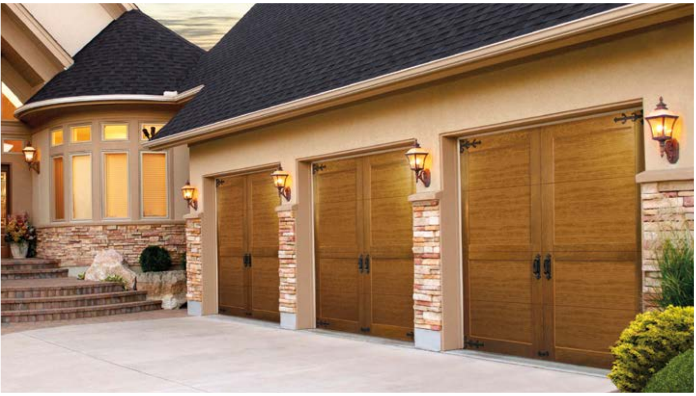
Canyon Ridge® Collection Ultra-Grain® Series Design 36 Shown in Medium Finish with Clear Cypress Overlays and TOP11 (Solid) Top Section (Model CAN236NCTOP11).