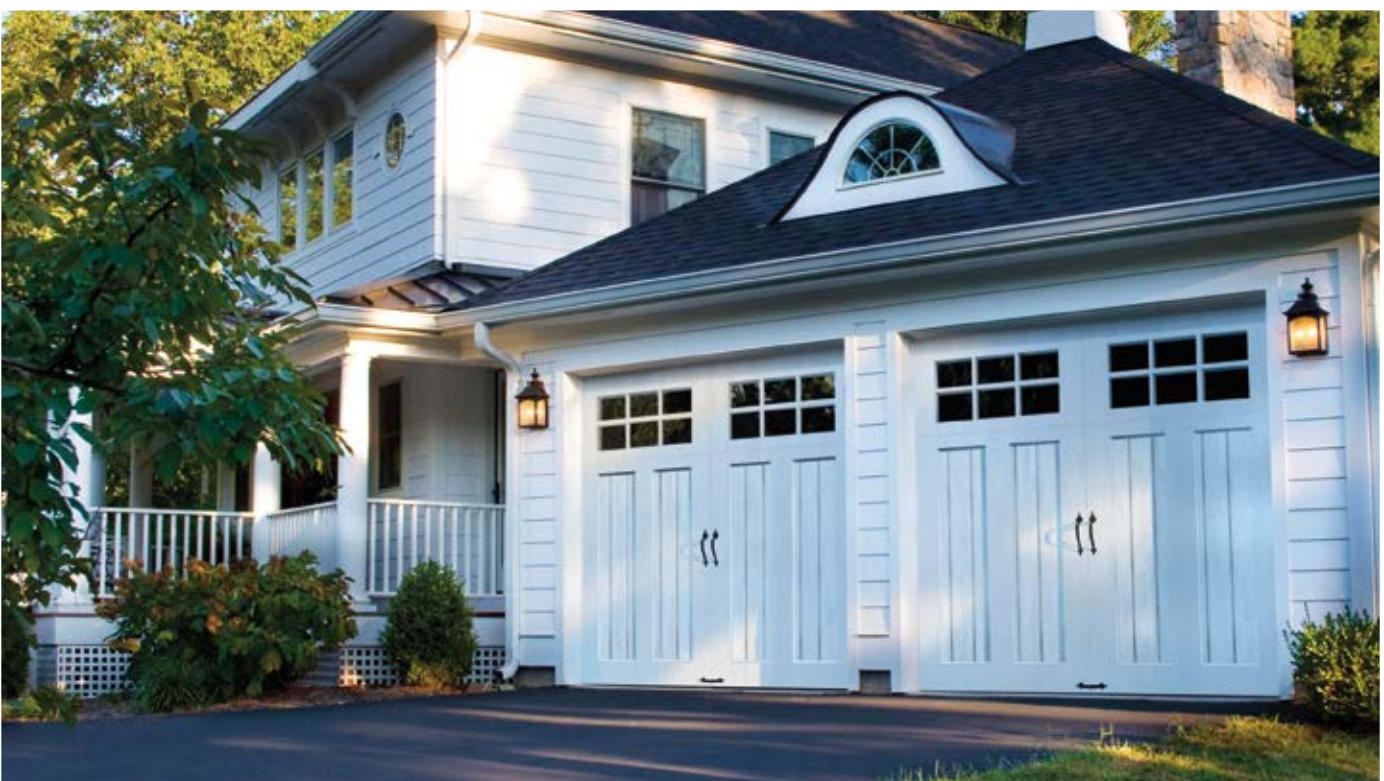
Canyon Ridge® Collection Limited Edition Series Design 12 Shown in Whitewash Finish with Mahogany Cladding, Mahogany Overlays and SQ23 Window Design (Model CAN212MMSQ23).

Note: Cladding and Overlay material options may be mixed and matched.