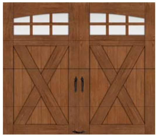
Canyon Ridge® Collection Limited Edition Series Design 21 Shown in Dark Finish with Clear Cypress Cladding, Clear Cypress Overlays and ARCH3 Window Design (Model CAN221CCARCH3).