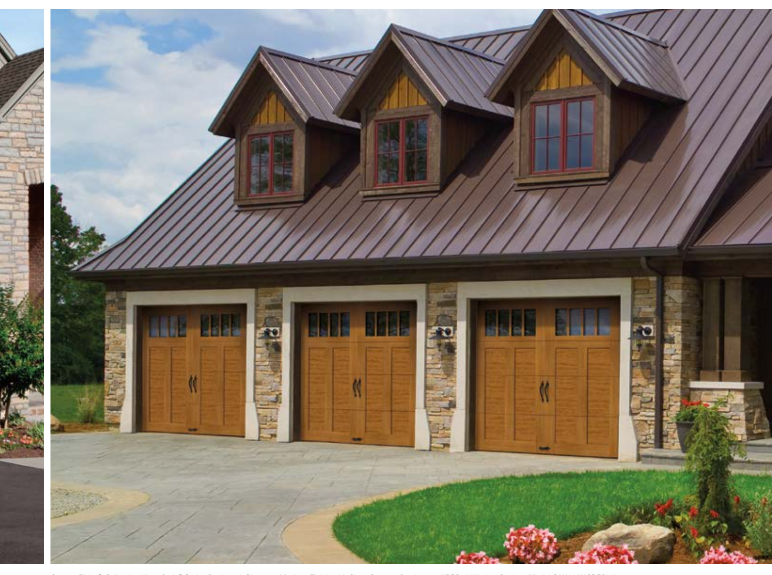
Canyon Ridge® Collection Ultra-Grain® Series Design 12 Shown in Medium Finish with Clear Cypress Overlays and REC14 Window Design (Model CAN212NCREC14).