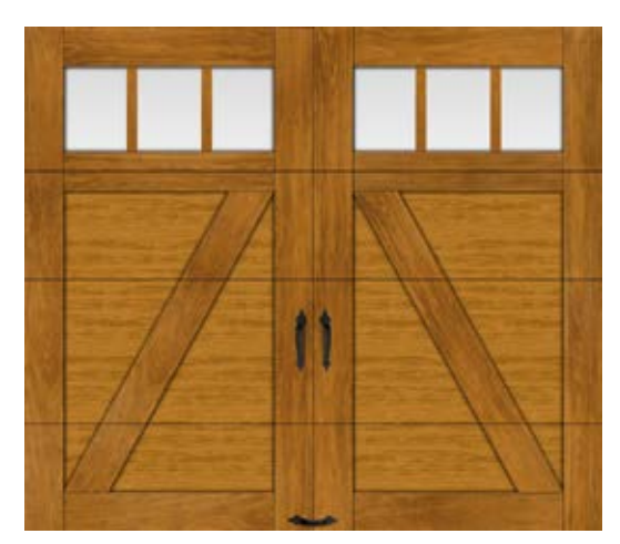
Canyon Ridge® Collection Ultra-Grain® Series Design 22 Shown in Medium Finish with Clear Cypress Overlays and REC13 Window Design (Model CAN222NCREC13).

An attractive and more economical alternative to the Limited Edition Series, this door features a 2" Intellicore® polyurethane insulated steel base door with Ultra-Grain®, a durable, natural-looking, woodgrain paint finish. Stained Clear Cypress composite overlays are applied to the steel door surface to create beautiful carriage house designs.